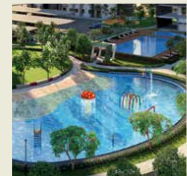
Water Play Park